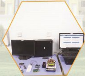
Internet of Things Lab