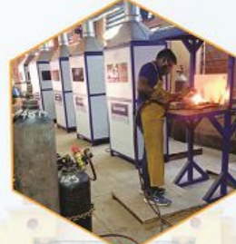
Welding (TIG/MIG/SAW/Plasma Cutting)