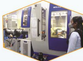
7 axis CNC Machine