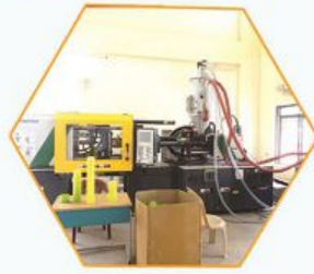
Automatic Injection Moulding Machine