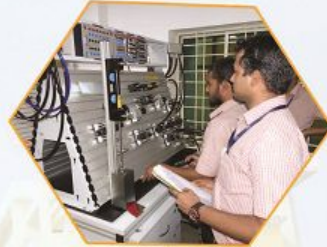
Hydraulic and Pneumatic