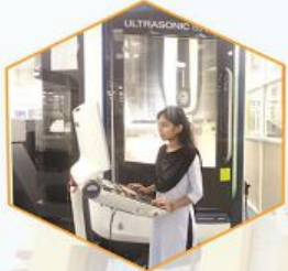
ULTRASONIC 5 axis CNC Machine