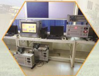
PLC & HMI Lab