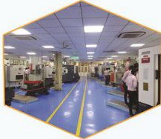
30nos CNC Turning & Milling Machine